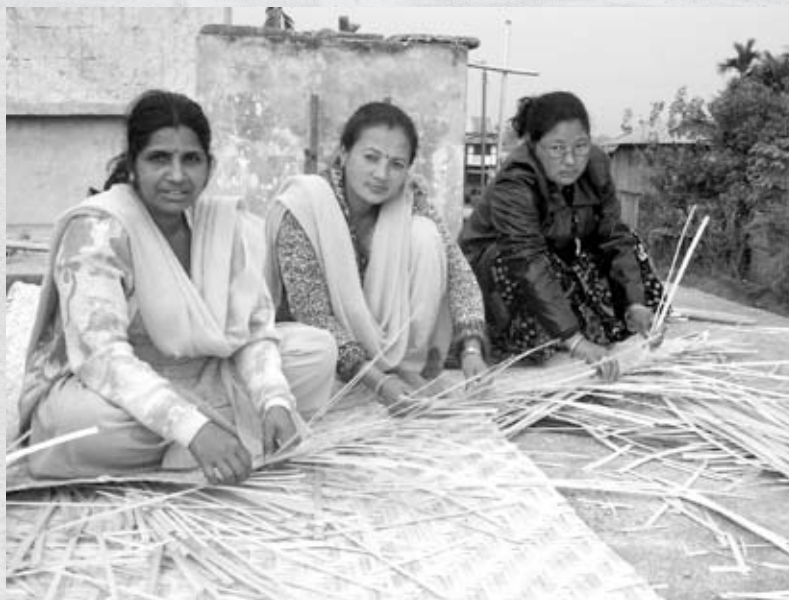
HABITAT FOR HUMANITY ASIA/PACIFIC

In tsunami-devastated Sri Lanka, between 2005 and 2009, Habitat trained nearly 200 homeowners in block making, carpentry, electrical wiring, painting and masonry. After work was completed on the tsunami response projects, the homeowners found employment in construction projects in eastern Sri Lanka and the Middle East.