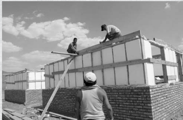
Masons and carpenters from the local communities were employed through the 30-house Blue Sky Build in Ulaanbaatar, Mongolia, which was completed in July 2010.

Habitat's enterprises also boost the local economy. With the November 2010 launch of Habitat Nepal's bamboo enterprise in Jhapa in the east, more jobs are created for people who work in the enterprise along with