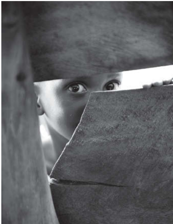
A child peers through the slats of a church at a Habitat for Humanity Uganda training in Mayuge, Uganda.