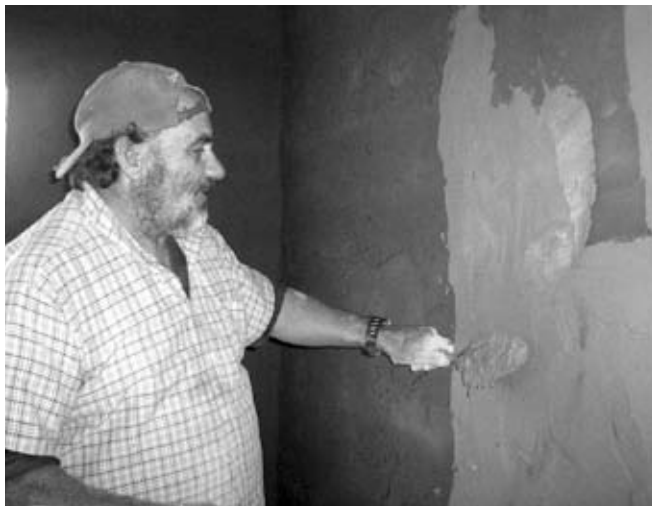
HABITAT FOR HUMANITY ARGENTINA